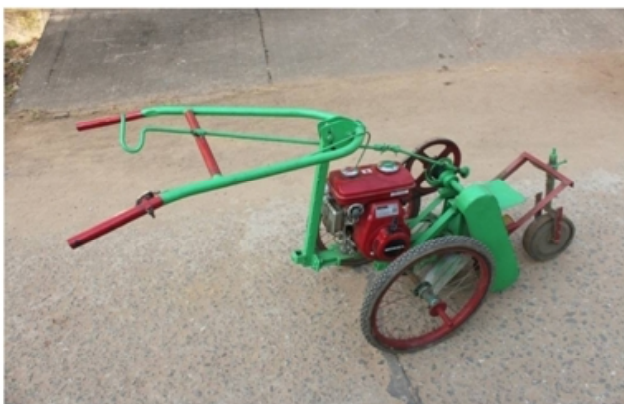
Plate 1. View of power weeder.

Four size of cutting blades having width 12 cm, 14 cm, 16 cm and 18 cm were designed to evaluate the