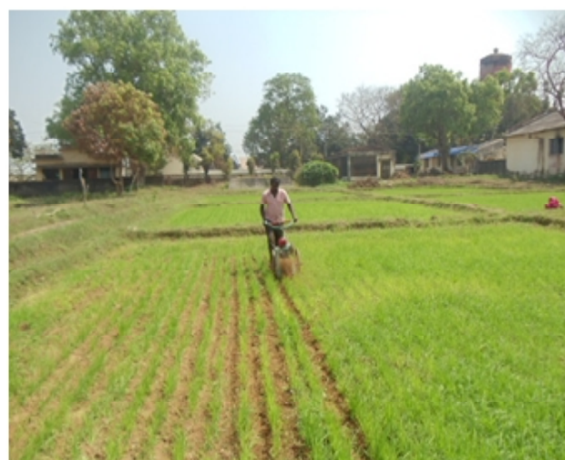
Plate 2. Power operated dry land weeder in operation.

Width of blade was selected as 12 cm, 14 cm, 16 cm and 18 cm for three different row to row spacing of rice crop 20 cm, 25 cm and 30 cm. For all three selected row to row spacing, there was no plant damage was found for 12 cm and 14 cm width of blade. As the width of blade increased from 16 cm to 18 cm plant damage was also increased for 20 cm and 25 cm row